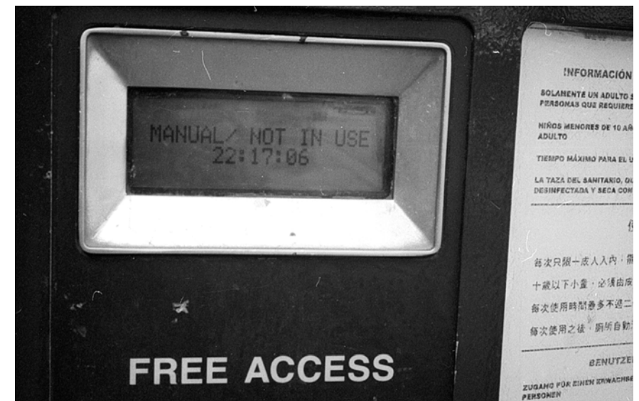
Automated Public Toilets